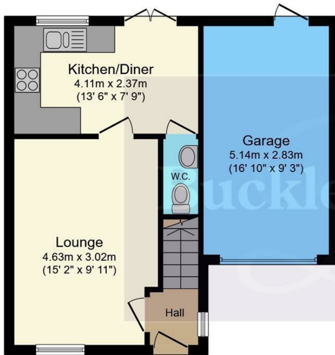
Ground Floor Floor area 44.7 sq.m. (481 sq.ft.)